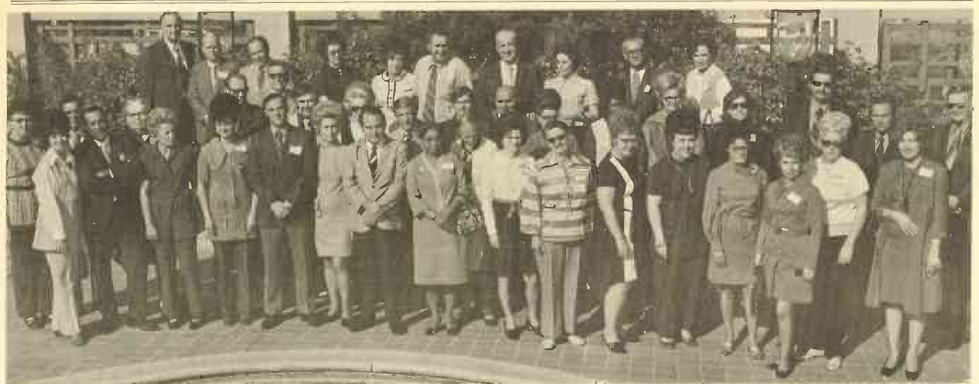
DELEGATES TO THE SOUTHWESTERN EDUCATIONAL CONFERENCE IN HOUSTON, TEXAS, TAKE A BREAK TO POSE ON HOTEL ROOF.