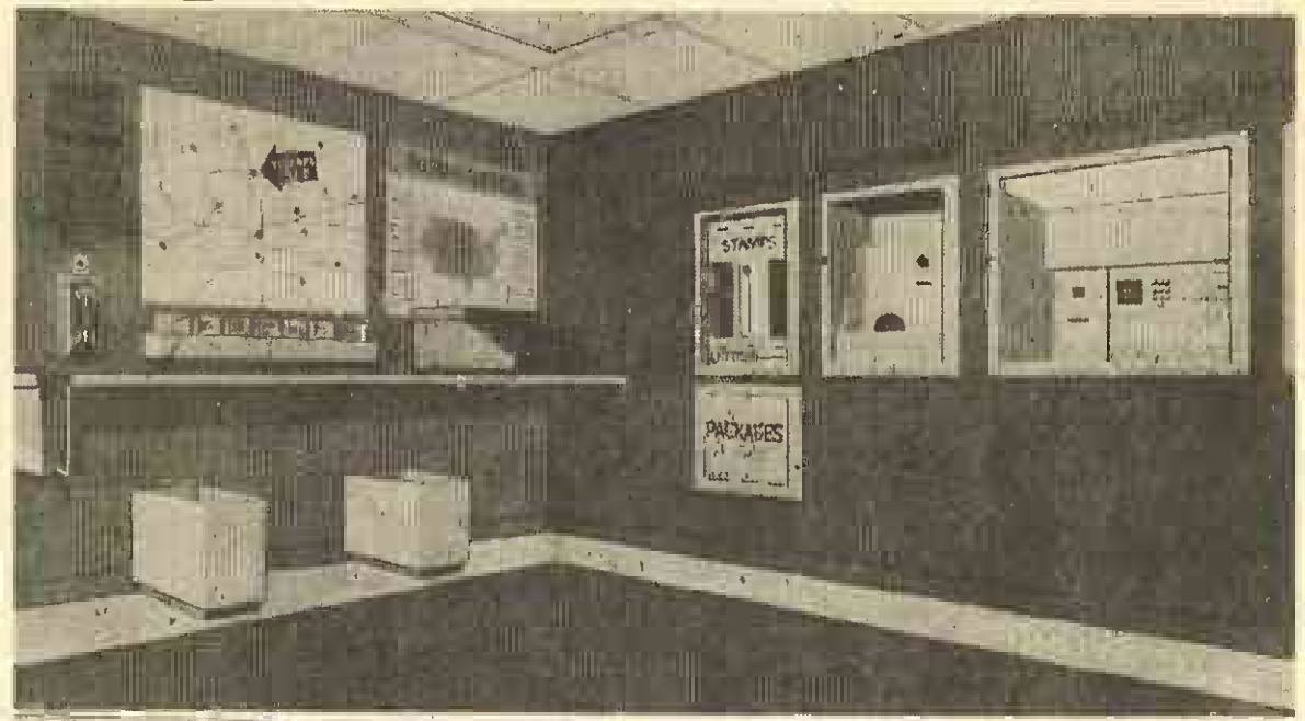
Interior of Huntington National's "Handy Bank," first fully automated banking facility scheduled to open early in the New Year in Columbus, Ohio.

A new concept in automated banking that can eliminate tens of thousands of jobs in banks was revealed at the annual convention of the Bank Marketing Assn. held in New York City.