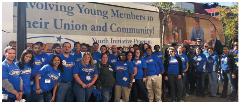
Approximately 100 OPEIU members aged 35 and under attended the AFL-CIO’s Next Up Summit in Minneapolis, Minnesota on September 28-October 2, 2011. They are pictured with OPEIU’s Rising Stars youth initiative bus.

Unions and reinforce the ideas and activities presented at the Next Up Summit. Our goals at OPEIU reflect the desire not only to continue the conversations begun in Minneapolis, but more importantly, to establish a model to develop and cultivate young leaders within OPEIU.