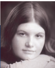
Viad Ciocoi Local Union 153 Region II