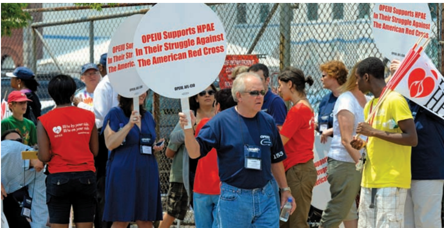
North Central-Erie/Northeast Area Educational Conference participants show union solidarity by joining the picket line at the American Red Cross Philadelphia headquarters with striking members of the Health Professionals and Allied Employees (HPAE), AFT/AFL-CIO.