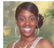
Chanel Collymore Local Union 153 Region II