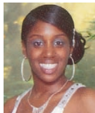
Chanel Collymore Local Union 153 Region II