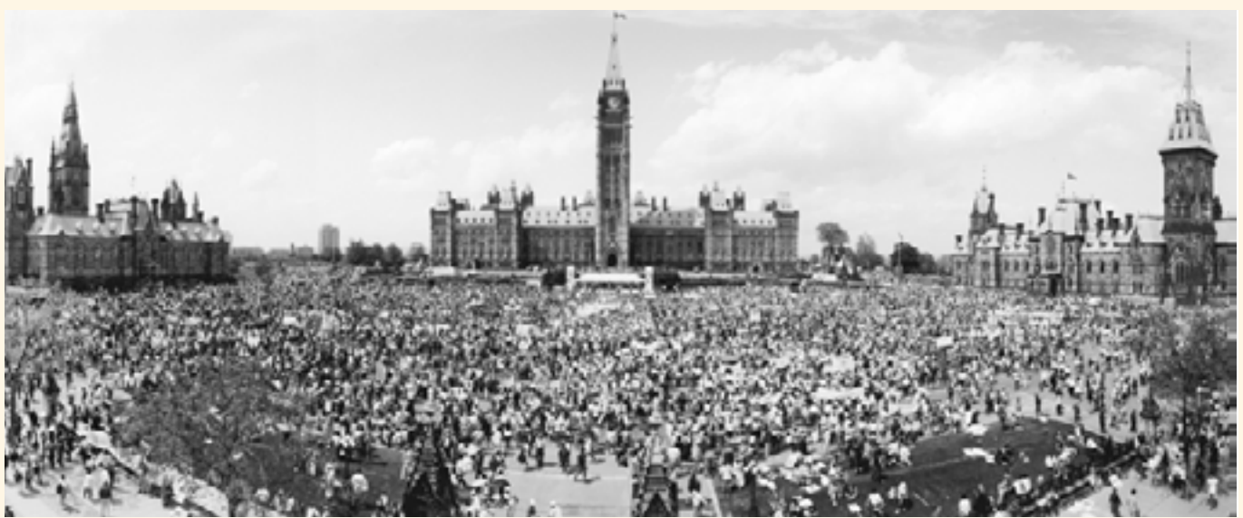
Canadian workers rally at nation's capitol in Ottawa, Ontario.

in the U.S. hits 14 percent. First U.S. Secretaries Day. Federal air traffic controllers begin a nationwide strike after their union rejects the government's final offer for a new contract. Most of the 13,000 striking controllers defy the back-to-work order, and are dismissed by President Reagan on August 5.