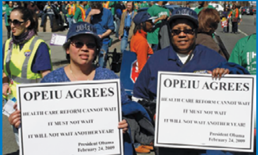
Local 32 members join the Health Care Rally in Washington, D.C. on March 9, 2010. With public pressure mounting, Congress passed health insurance reform on March 21.