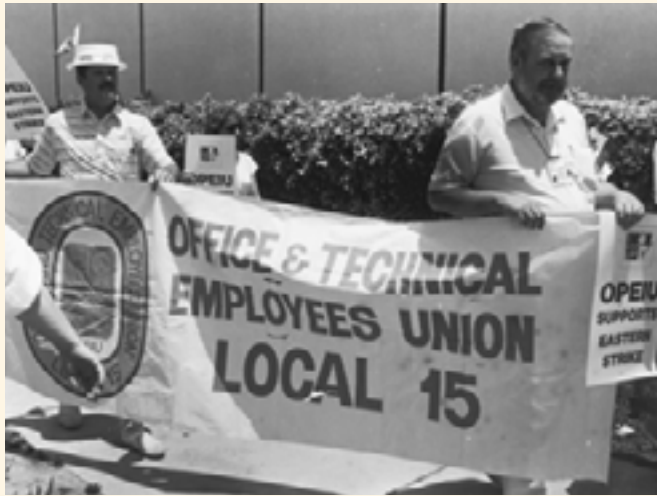
Local 15 convention delegates support Eastern Airlines strikers in Miami, Florida.

attempt against Mikhail Gorbachev fails, but precipitates the collapse of the Soviet Union.