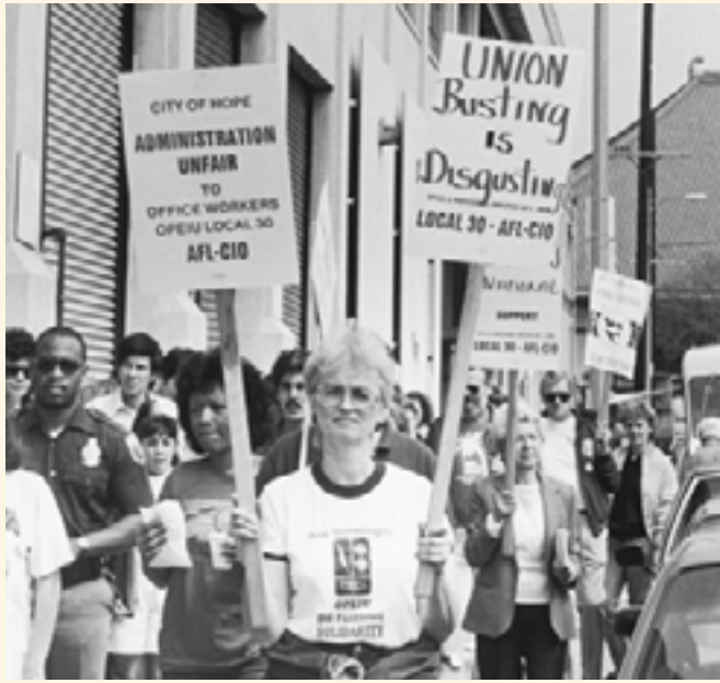
Local 30, San Diego, California, members protest City of Hope administration's union-busting practices.

following twelve days of secret negotiations at Camp David.