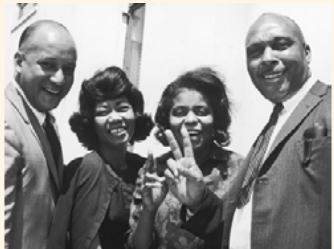
Workers express joy at passage of Civil Rights legislation in 1965.

Organizing: Owens-Illinois Glass (Waco, Local 277); several credit unions (Detroit,