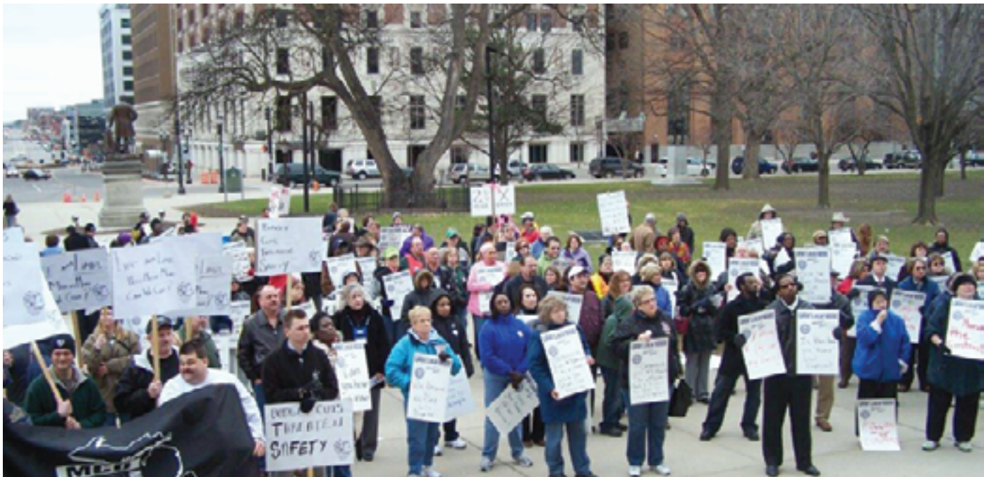
MAGE-OPEIU Local 2002 members rally at the State Capitol in Lansing, Michigan.