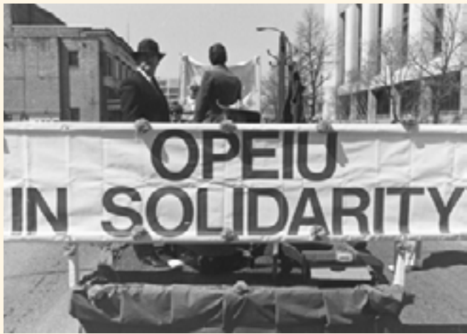
OPEIU float in support of solidarity.

October 19, 1987, the Dow Jones Industrial average fell 22.6 percent, the largest one-day decline in recorded market history.