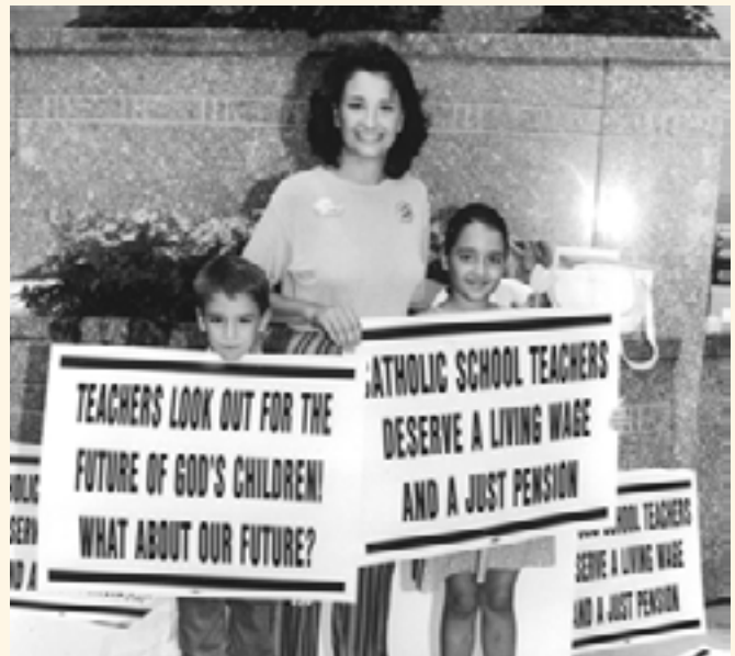
Children join in support of a Federation of Catholic Teachers' new contract.

2001 September 11, 2001 (9-11), a series of coordinated suicide attacks against targets in the U.S. that involve hijacking four commercial airliners. The jets are used as flying bombs, killing 2,995 people at the World Trade Center, the Pentagon and a Pennsylvania field. In addition to the loss of life, the twin towers of the World Trade Center and five other buildings in NYC are destroyed or partially collapsed, and a portion of the Pentagon are also severely damaged. Because of the attacks, the United States, with support from the United Kingdom and