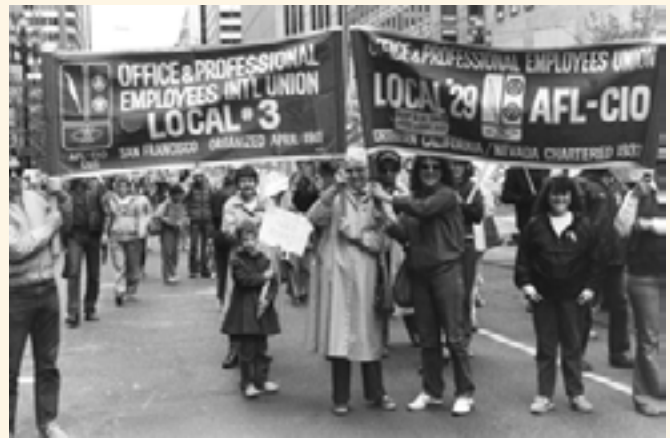
Local 3, San Francisco, California and Local 29, Northern California/Nevada, at a march.

OPEIU begins participation in Union Privilege Program, paving the way for the OPEIU MasterCard. OPEIU participation continues to this day.