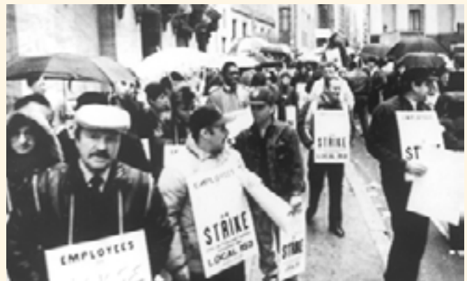
Local 153 members on strike on Wall Street in 1985.

1987 Pay equity legislation is passed in Ontario. A West German pilot lands unchallenged in Moscow's Red Square. Black Monday,