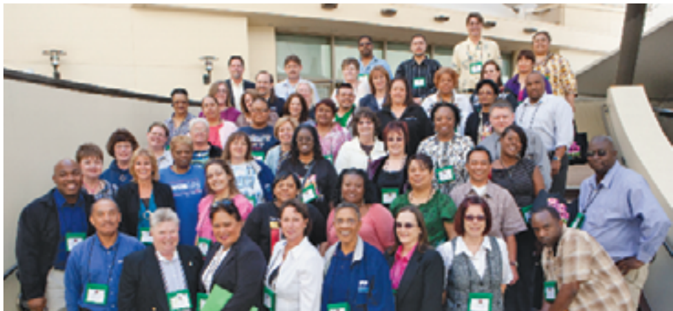
Delegates to the 2010 Union Delegate Conference of the Coalition of Kaiser Permanente Unions.

The conference opened with a tribute to AFL-CIO President Emeritus John Sweeney, who was instrumental in the establishment of the Coalition. The delegates then learned more about what it means to be part of a unit-based team, how to communicate correctly as a team, and how to step up as a leader, regardless of your position on the team.