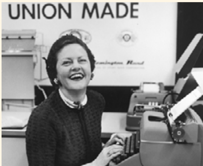
A happy member.

Organizing: City of Hope (Los Angeles, Local 30); Federal Cartridge (Minneapolis, Local 12); Southern Union Gas (Galveston, Local 27); Cutter Labs (Oakland, Local 29); Pantex Atomic Plant (Amarillo, Local