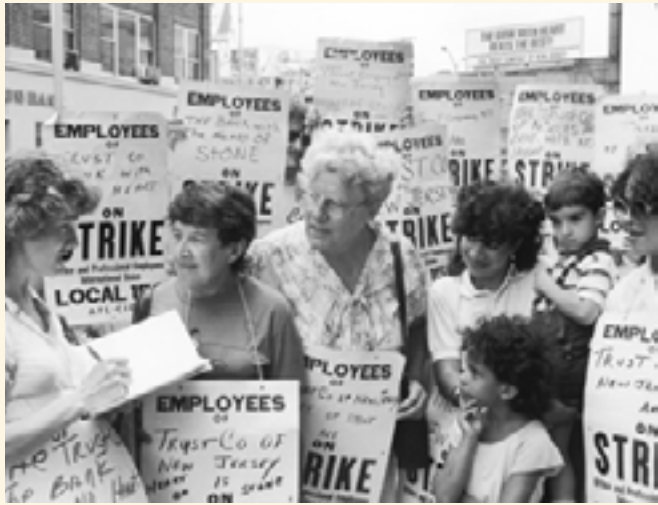
Local 153 members on strike against the Trust Company in New Jersey.

San Diego Hospital workers win their first contract. OPEIU members at the New York Stock Exchange strike for improved pension and health care benefits. Local 1 celebrates its 80 th anniversary.