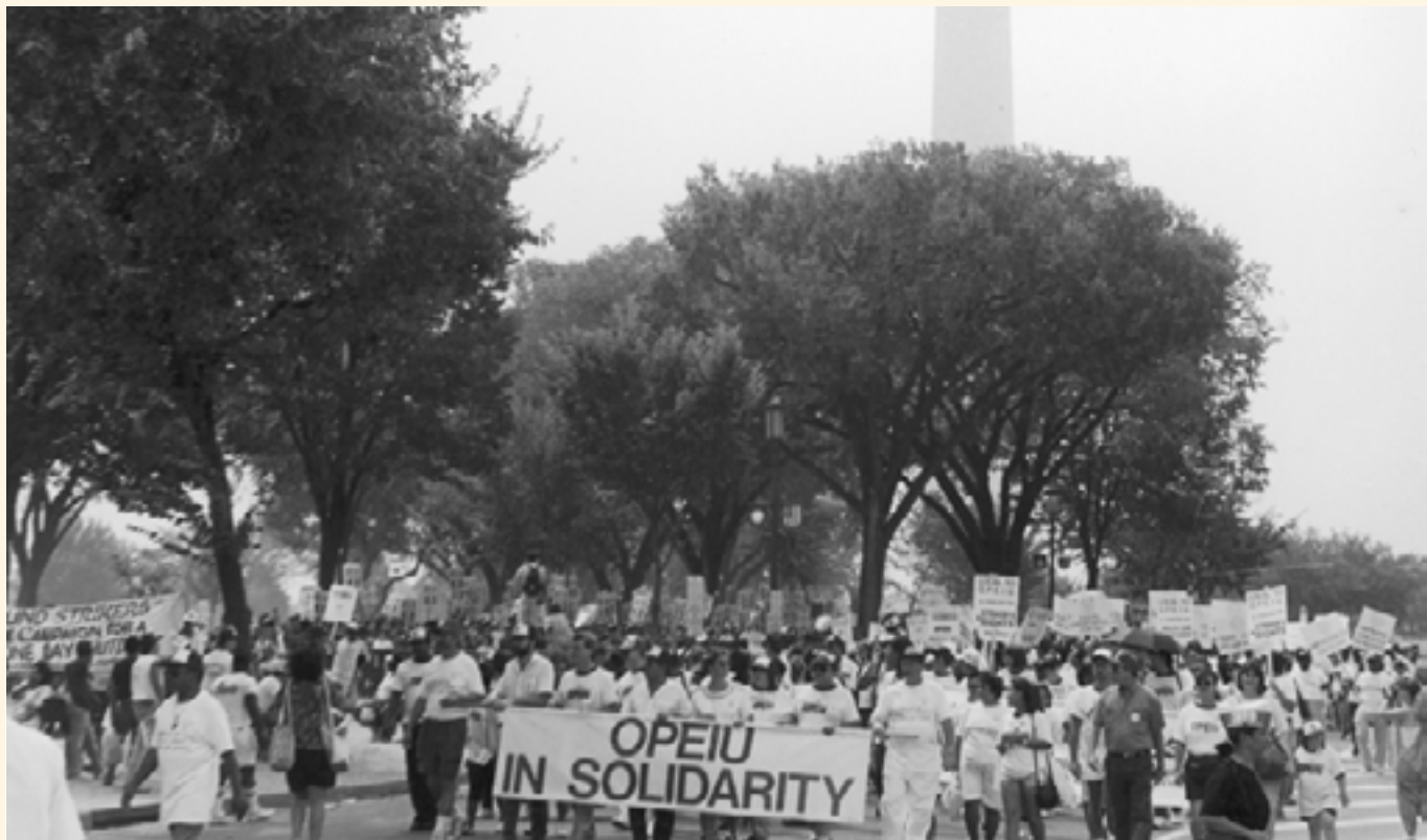
AFL-CIO Solidarity Day 1981.

1984 The U.S. Center for Disease Control announces that a