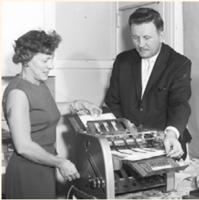
Producing labor materials.

Medical Bureau (Local 23); B.C. Office Employees Association (affiliations with Local 378, Vancouver); Knights of Columbus Insurance (New Haven, CT, Local 329); reach a first contract after a four day strike; Vancouver membership of B.C. Electric affiliates with Local 378.