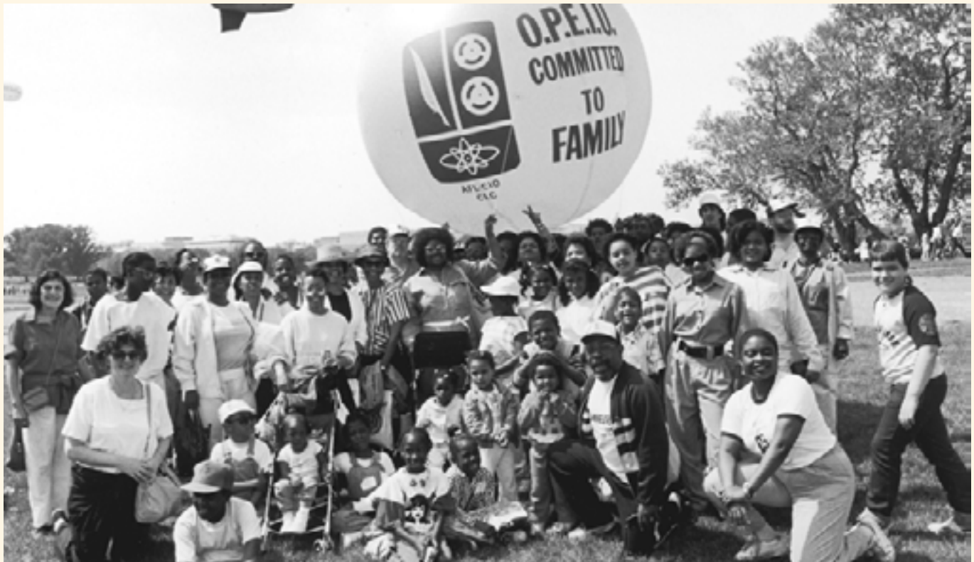
OPEIU members and their families at Family Day, Washington, D.C.

OPEIU conducts an education conference, where participants learn how to lobby on behalf of members and their families.