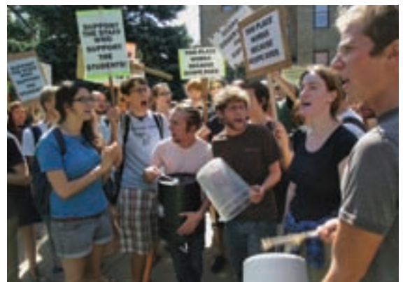
Oberlin College students get involved and show their support for Local 502 workers!