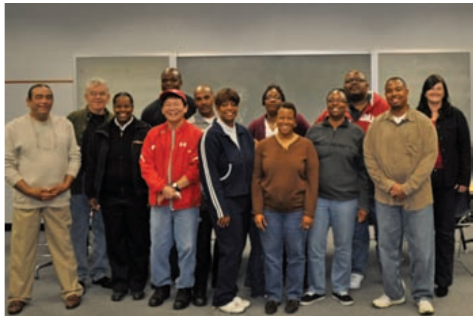
Road supervisors, dispatchers and classroom trainers at Metro Access and the Fairfax Connector choose Local 2 in September 2011!

In more Local 2 organizing news, two additional work groups at Kaiser Permanente have joined Local 2, the material coordinators and medical coders. An overwhelming majority of the 45 workers voted yes to join the union. They will be covered under the current agreement between Kaiser and the Coalition of Kaiser Labor Unions, of which Local 2 is a member.