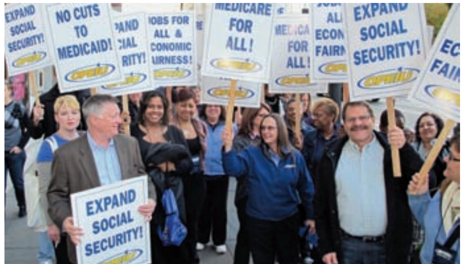
Members of Locals 3 and 29, as well as participants of the West/Northwest Area Educational Conference, take to the streets to join the Day of Action in San Francisco to Stop the Cuts!

“The voices of the real people need to be heard to drown out the misrepresentations (Continued on page 8)