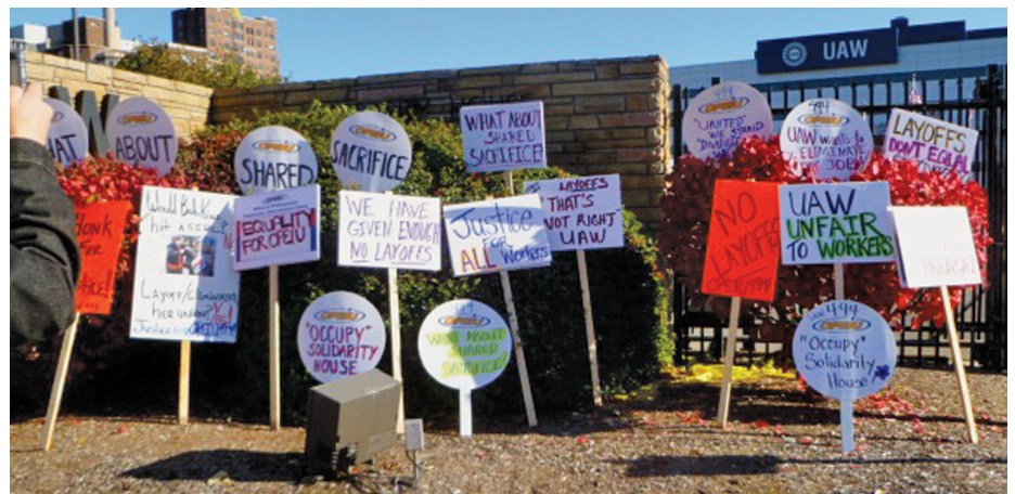
Local 494 picket signs outside UAW headquarters in Detroit, Michigan.