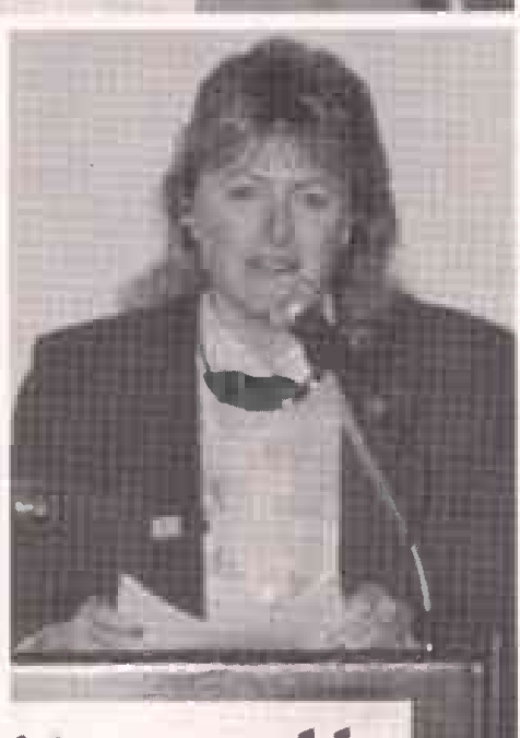
Members participate in workshops at the 2003 OPEIU Canadian Organizing Summit.