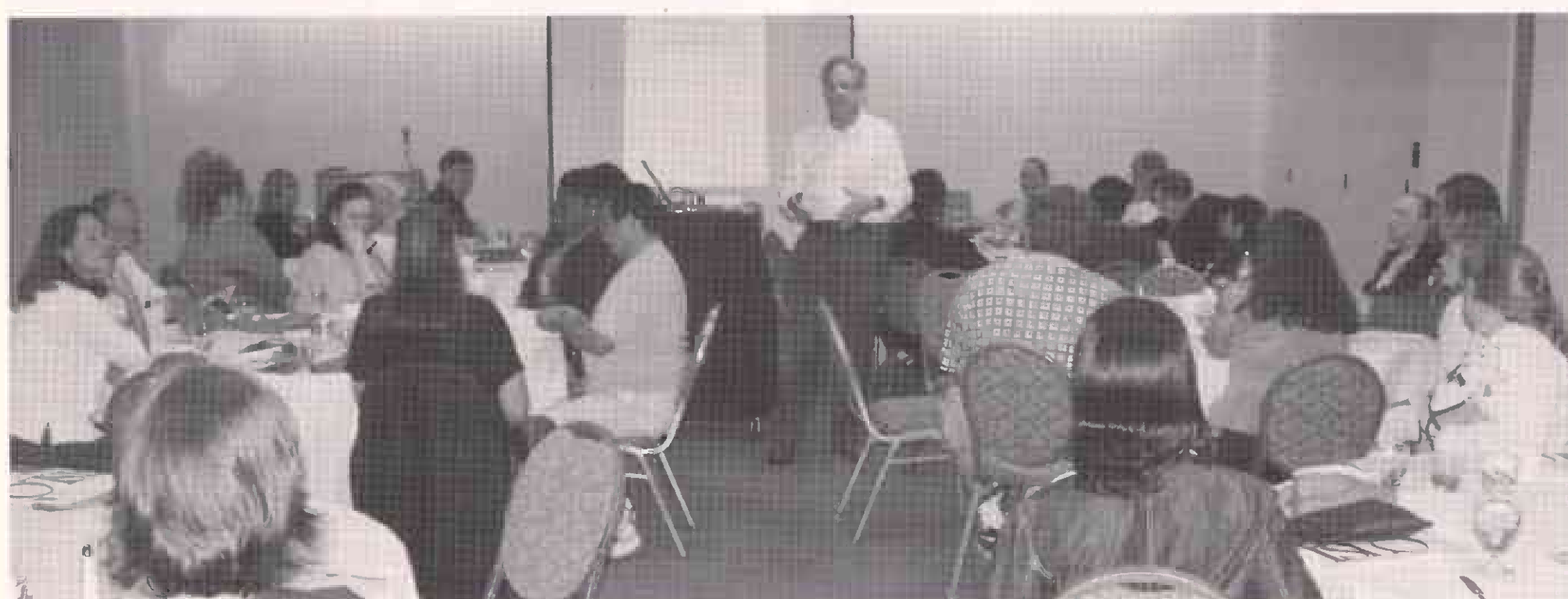
Members participate in the West/Northwest Area Educational Conference held in Anaheim, California, May 16-18.