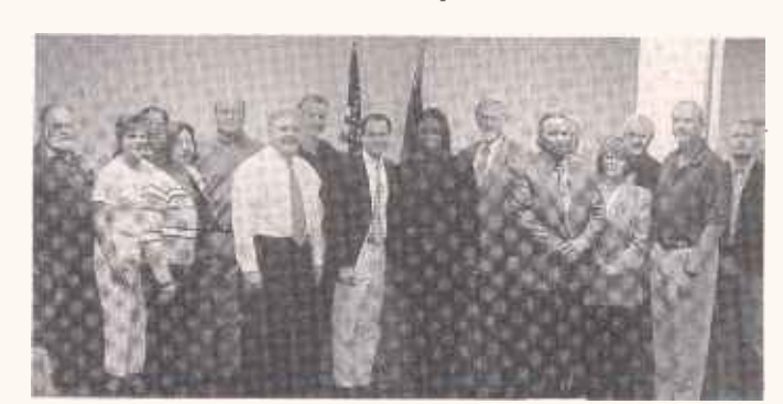
OPEIU/MAGE Local 2002 participates in Michigan State AFL-CIO conference with public employee unions to discuss strategies on how to deal with the state budget.

I am writing to you to share OPEIU's concern about plans for state employees to shoulder $250 million of the $1.8 billion. Our concern is for the morale of your managers and supervisors who have already endured a very