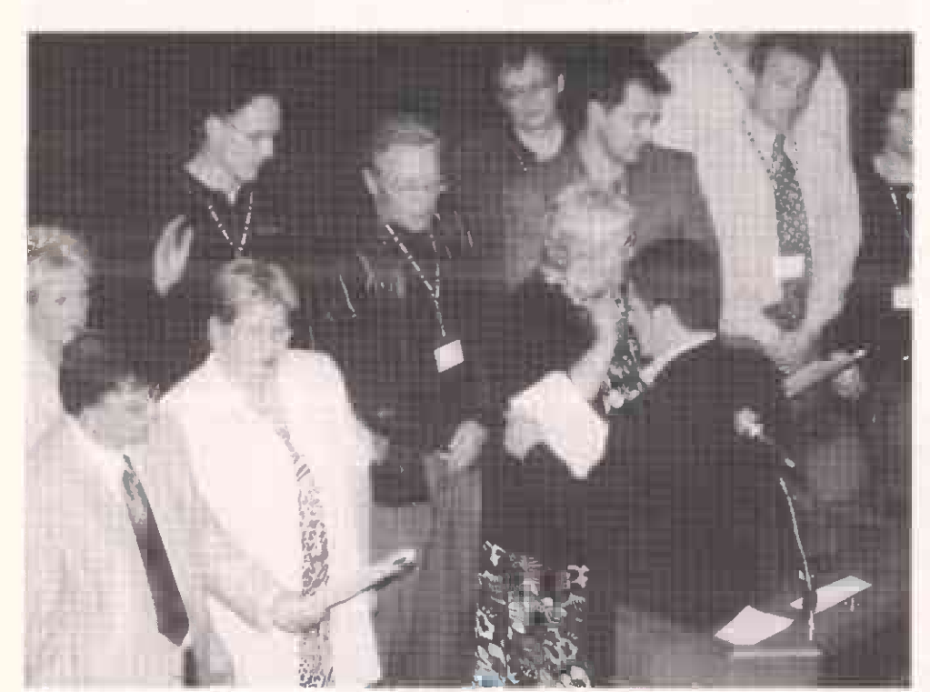
The new executive committee takes the oath of office,