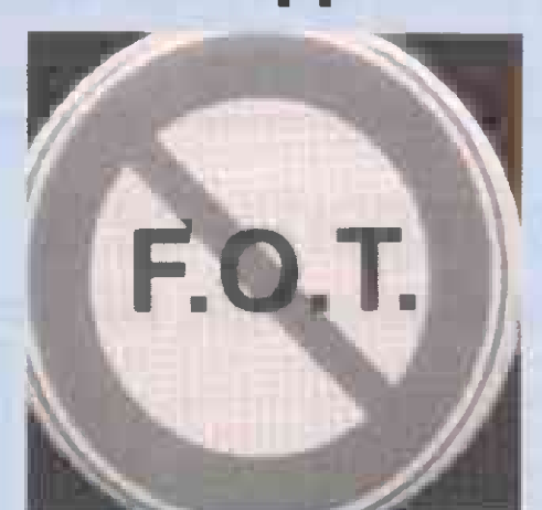
A "No F.O.T." button.

In 1999, Local 40 distributed "No F.O.T." buttons to registered nurses (RNs) at Mt. Clemens in support of its opposition to forced overtime. After the buttons were distributed, management at Mt. Clemens confiscated them, taking them out of RN mailboxes and away from nurses who were wearing them.