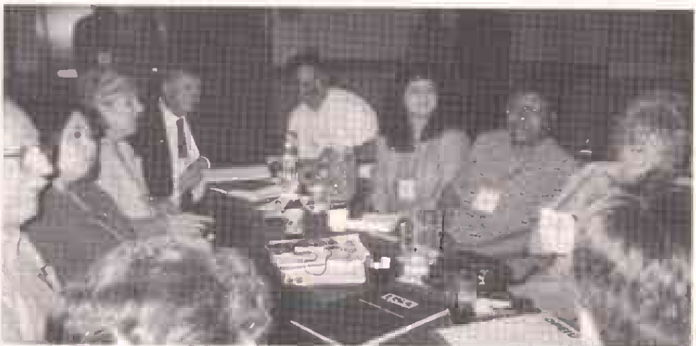
Southeast/Southwest Area Educational Conference members in Tunica, Mississippi, May 30-June 1.