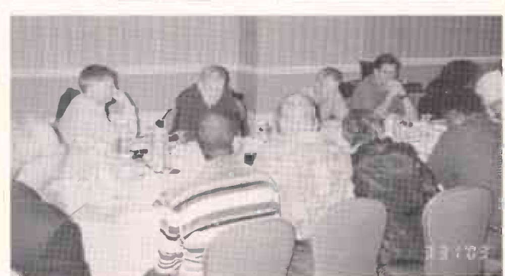
Organizers learn new techniques at OPEIU/ITPE, Local 4873 organizing conference.