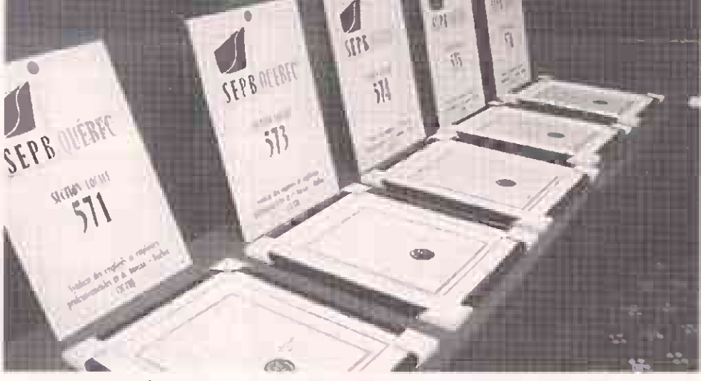
Five of the eight new SEPB Quebec Local Union charters,