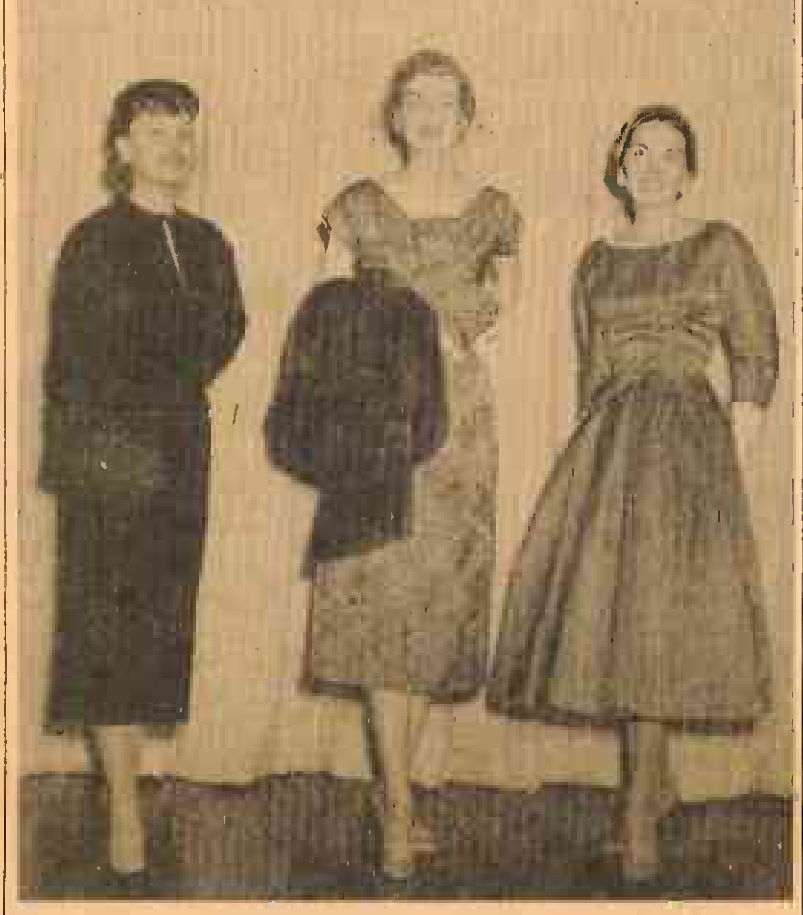
Pretty as a Picture

Grand Rapids, Mich. -- OEIU Local 353, in addition to a $5 general wage increase, secured an paid insurance policy, an extra paid holiday and also a 30-hour work law specifically states that a union, UWA Locals 1231 and 19.