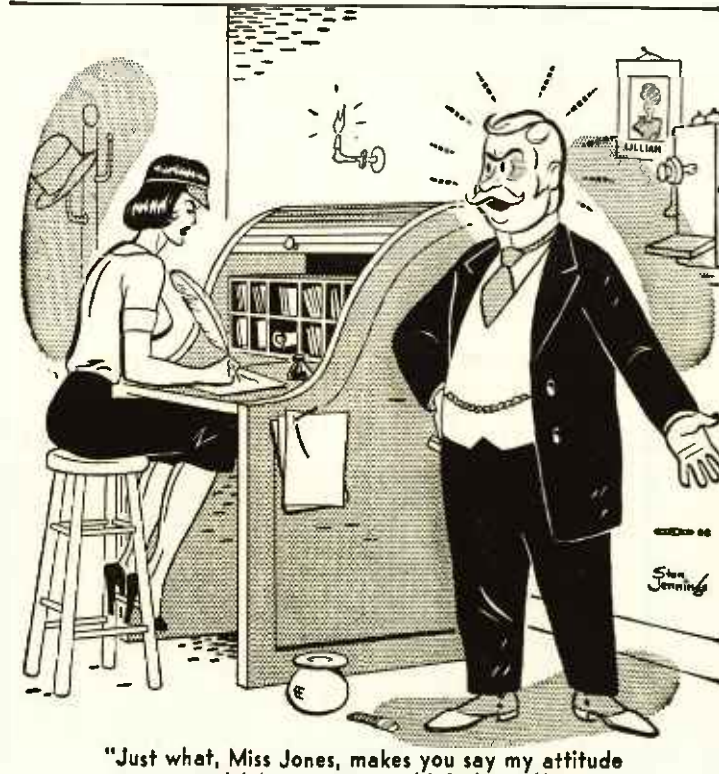
toward labor unions is old fashioned?"

"We'll continue to appeal to the white-collar worker, but we're goming to place heavy emphasis on the skilled workers, America's rich-est market." — (Milwaukee Labor Press.)