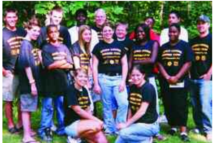
Campers at the Romeo Corbeil/Gilles Beaugard 2005 Summer Camp.