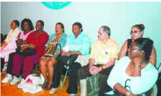
Members of the GHI negotiating committee.