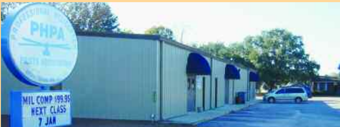
The new PHPA headquarters and site of the offices of Local 102, Daleville, Ala.