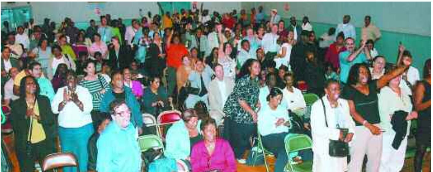
GHI employees ratifying their new contract.