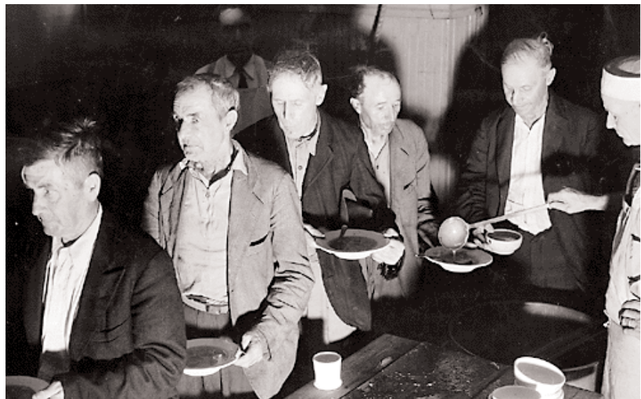
The need for Social Security grew out of the stock market crash of 1929! So now we should put our money back there?

Bush talks about how private accounts give people control over their money. That is simply not true. The guidelines for what can be invested in will be stringent. The money cannot be touched until you reach your retirement age. When it is time to finally draw from the account it has to be immediately put into an annuity.