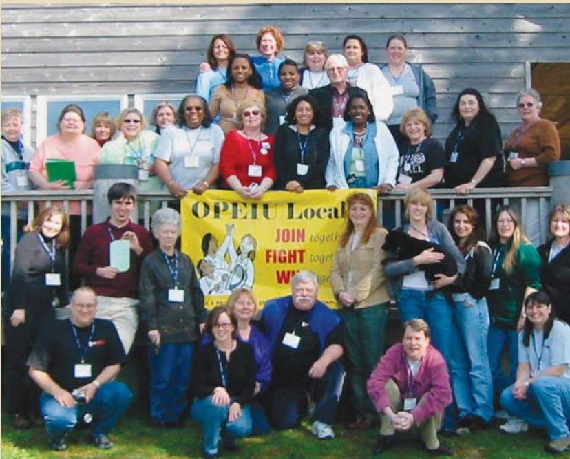
Members from across Washington State meet in Tokeland to develop a plan to increase membership representation and involvement.

This was the second Local 8 statewide summit; the first one, held in 2003, laid the groundwork for the 2005 summit, in which these historic recommendations were made.