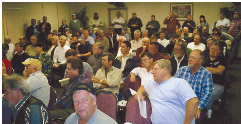
Local 107 helicopter pilots listen intently to reports from their leadership on the status of negotiations.