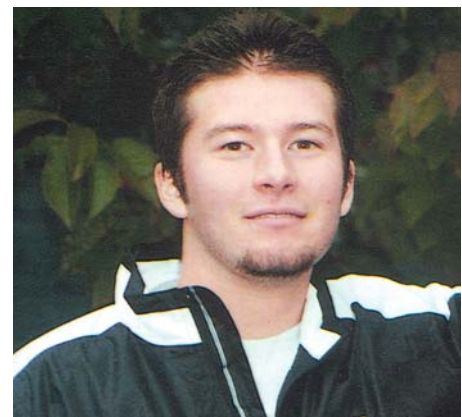
... and today as a freshman at Tufts University.