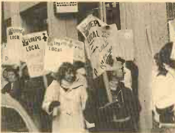
In a struggle between the employees (OPEIU Local 225 members) and Union du Canada Assurance,