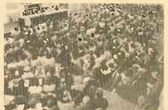
Prior to ratification, Local 434 members listen to explanation of their new agreement at Montreal City and District Bank.