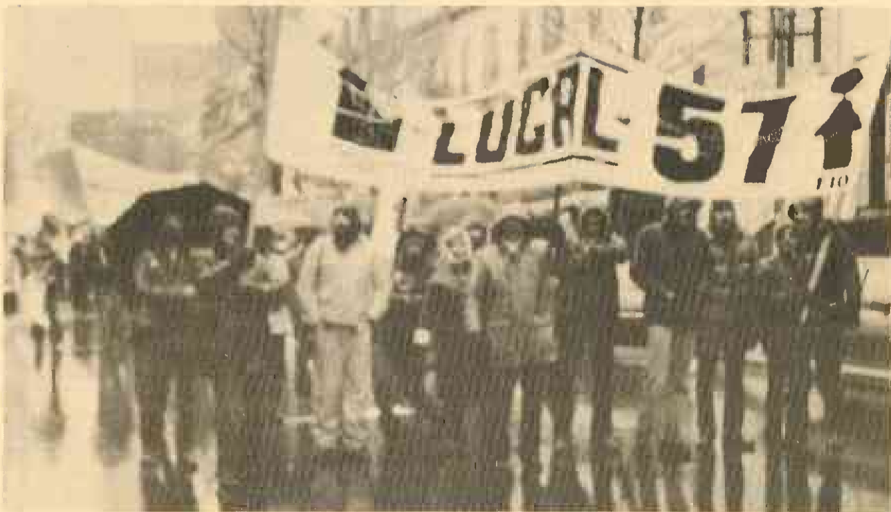
Pictured above are delegates of OPEIU Locals 57 and 434 in Montreal, who participated in the Saturday, April 3, labour movement demonstration against the present crisis of high unemployment, high interest rates and bad government policies in fighting inflation. Some 30,000 workers and trade unionists participated in the Montreal march, while similar demonstrations were held throughout Canada.