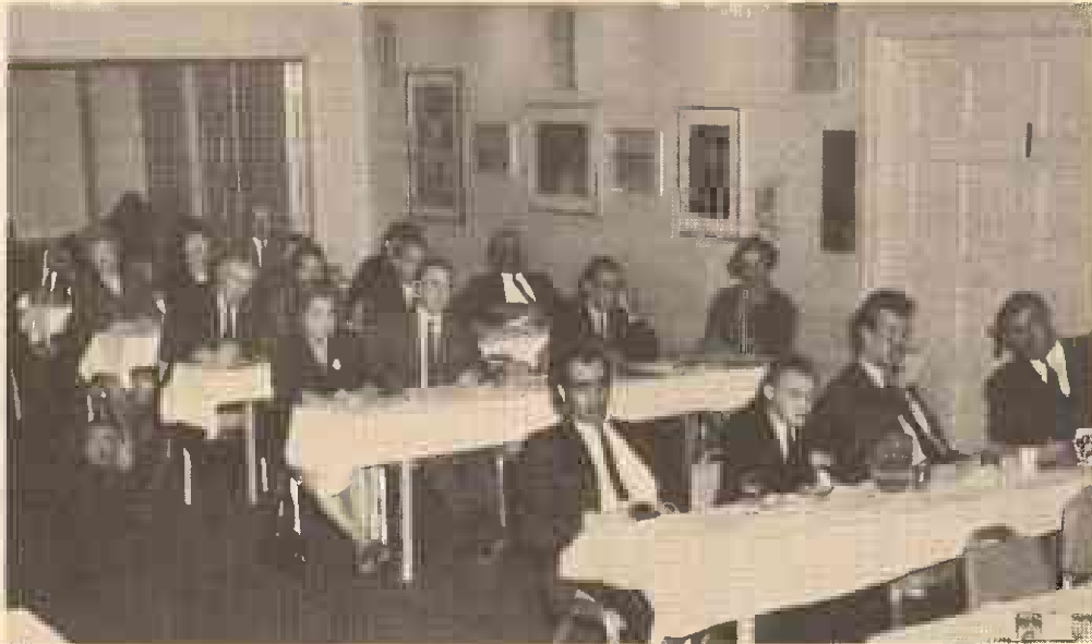
An attentive moment at the Montreal conference of representatives of the OPEIU and its local union affiliates. More photos on page 3.