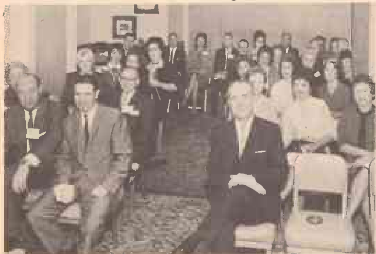
The Western Educational Conference was held in Los Angeles on November 2 and 3.