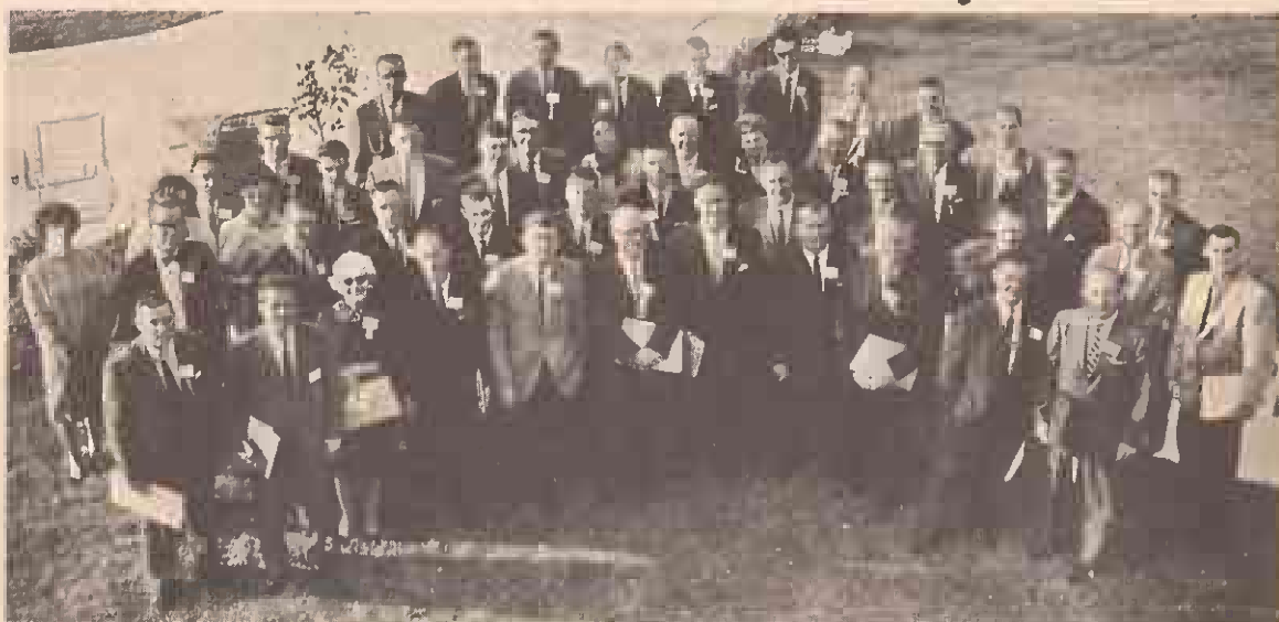
This fall's Canadian Educational Conference held at Quebec City, P. Q., took place on October 19 and 20.