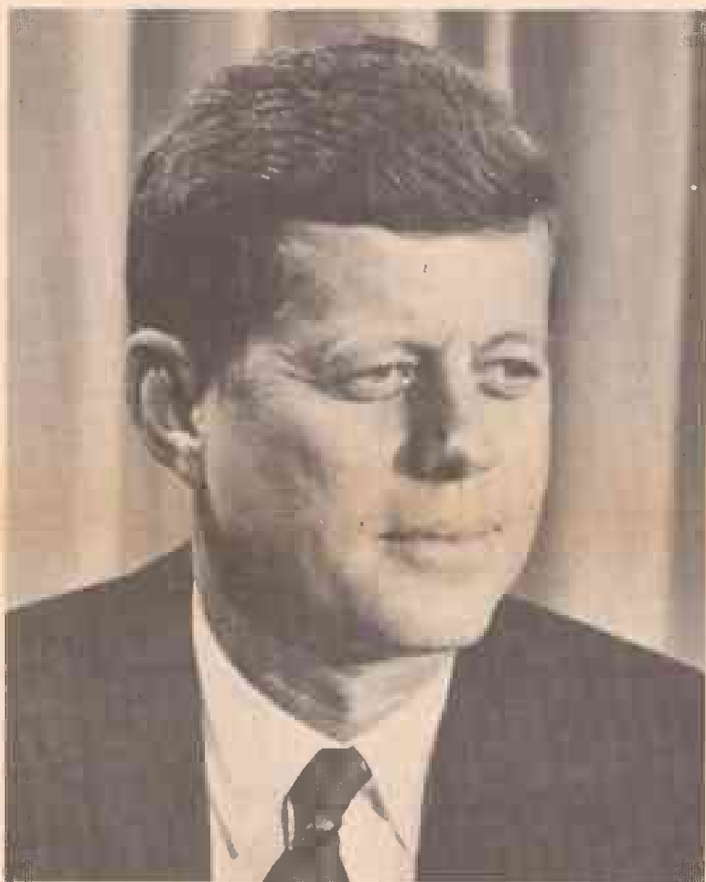
John F. Kennedy (1917-1963)