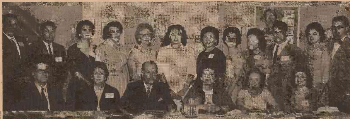
Group photo of those attending Southeastern Conference at Lexington, Ky.

Delegates selected Memphis, Tennessee as the site for the next Conference meeting to be held in the fall of 1961.