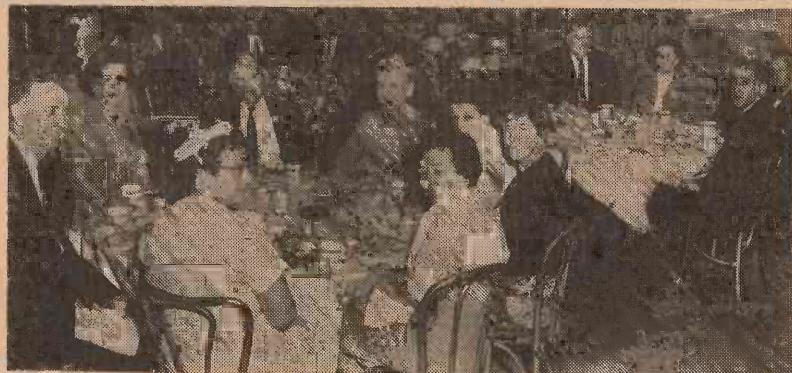
Above two scenes show delegates at Northeastern luncheon.