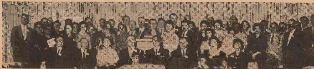
This was scene as North Central Conference met in Kankakee, Ill.

Approximately 65 delegates assembled at the Kankakee Hotel in Kankakee, Illinois to attend the semi-annual meeting of the North Central Organizational Conference.