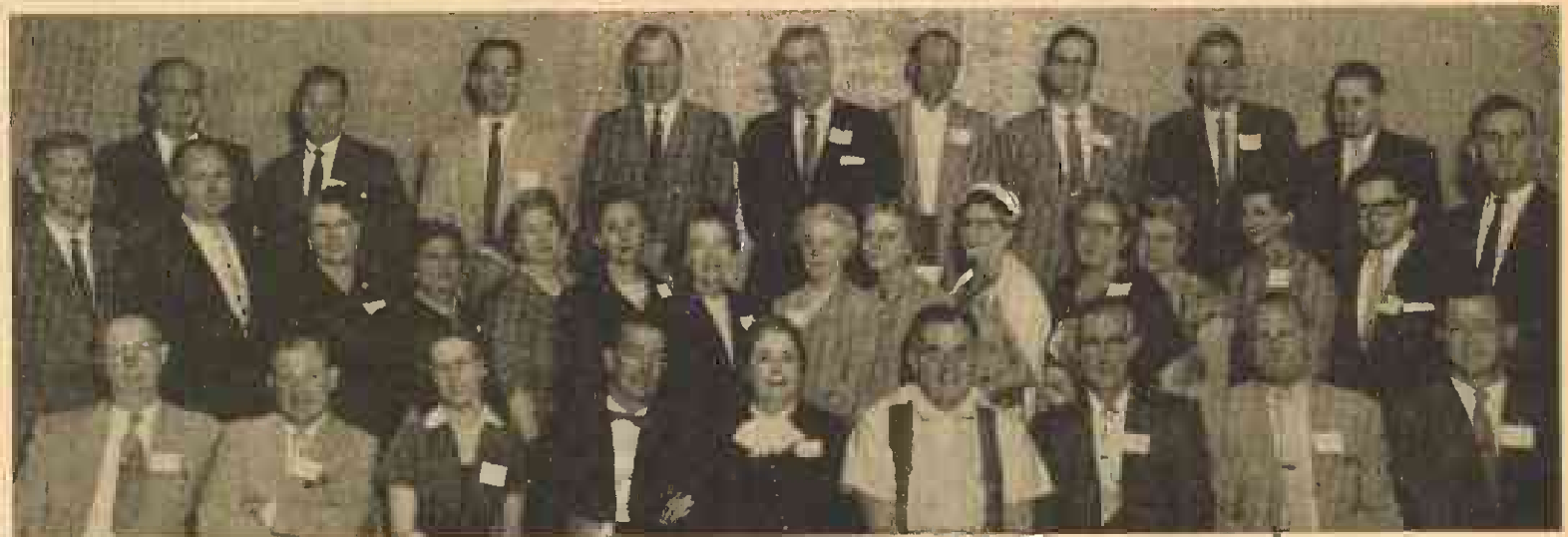
Delegates who attended the sessions at Fort Wayne, Ind. (Story, page one.)