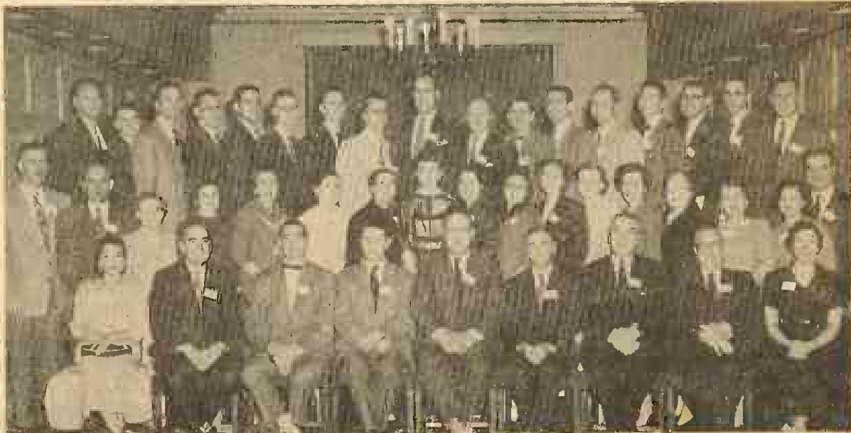
Group that attended session at Chateau Laurier.